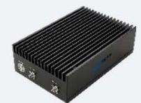
Available 220V System Benchtop Amplifier