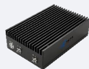
Available 220V System Benchtop Amplifier